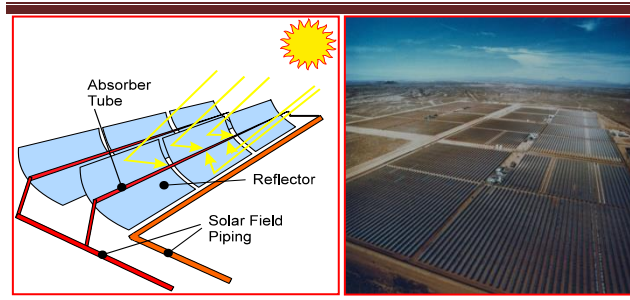
Fig.2 Solar Collector