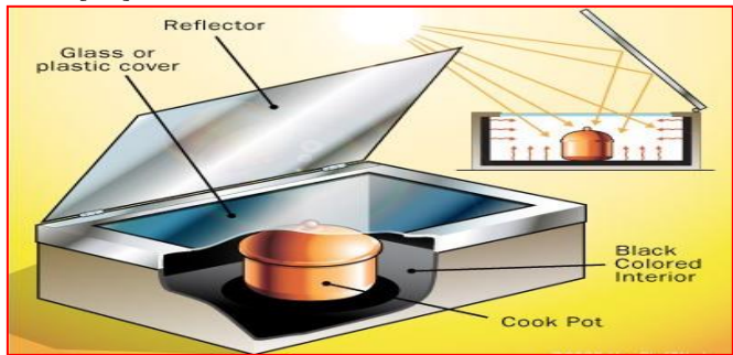
Fig. 3 Solar Cooker

Solar energy used coocker is a device operating by the energy of sun for heat and cooking purpose at very low cost. Many solar cookers are relatively inexpensive although some of them are as expensive and advanced, large-scale solar cookers can cook for many people. Concerned to green revolution it is also very useful because it does not use any fuel and can be use for out-door cooking and the health and environmental consequences of alternatives are severe.[6-9]